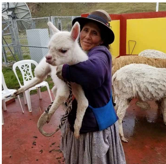
The farmer and her beloved cria.

The team evaluated 6 animals, 5 Huacayas and 1 Suri. There are 2 males and 4 females, all are less than 2 years old that had the best characteristics of the species. None of the females were pregnant. The team chose two young males < 2 yrs. of age as future herd sires. It appears that she cares for these animals on her own. She is in desperate need of help. It is obvious that she loves her animals and tries hard to protect her babies as demonstrated in the photos below.