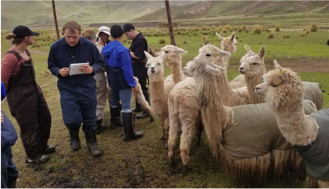
Team working with the farmer's herd. Most of the animals are covered to keep their fiber clean for competitions