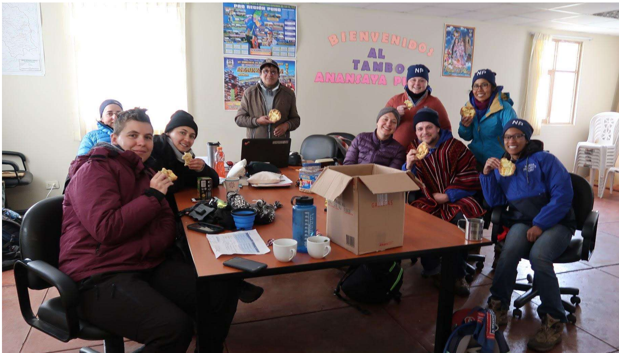
One farmer came to apologize for canceling the visit due to the bad weather. He brought a box full of just baked homemade bread with cheese for the team.