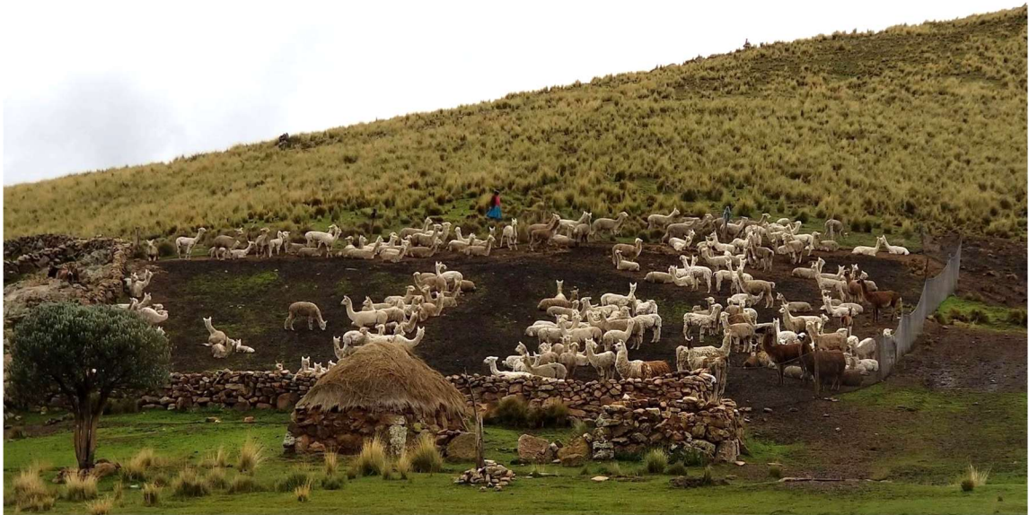
His partner's herd in corrals where they usually spend nights.