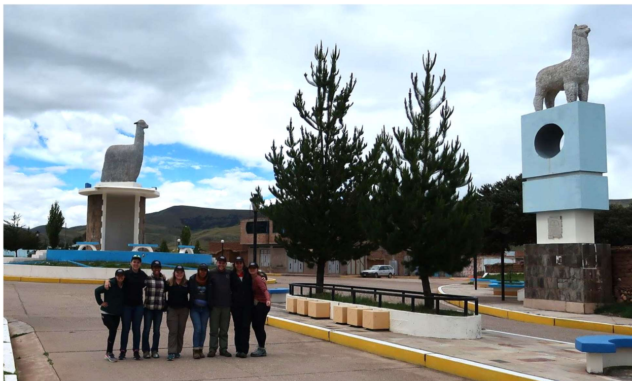
The team at the entrance to Nuñoa.

Farmers and team members discussed the plans for the work in the morning. The volunteers were introduced to the farmers. Farmers gave their reservations about the age of our loaner males (older than they usually use but still producing good offspring and having good pregnancy results), and working in the afternoon. Many of the farmers were concerned about the thunderstorms in the afternoon, as there had been recent reports of electrocution of some herders.