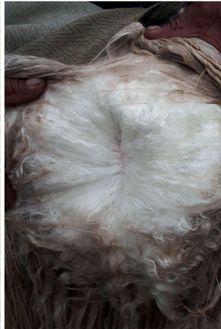
Left: One of the farmer's best Huacaya alpacas. Right: Fiber from one of the best Suri alpacas he has.