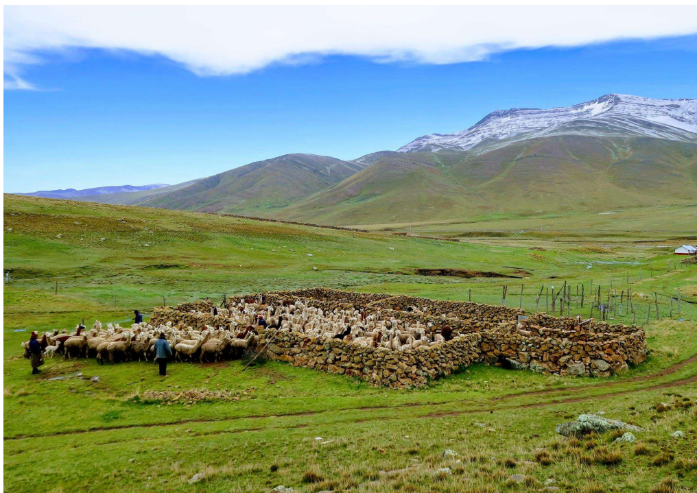
Farmer #1's herd in the examination corral.