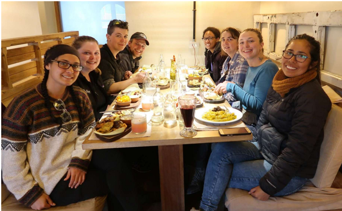
Last meal of the NP team in Ollantytambo.