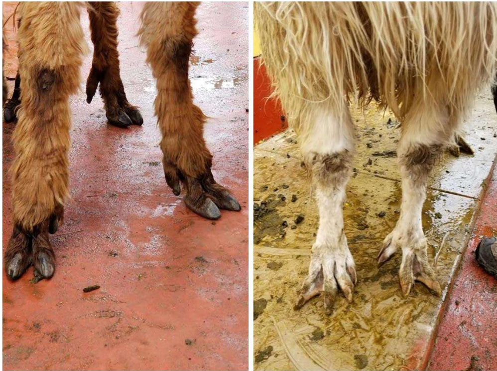
Polydactyly, evidence of inbreeding problems in a herd.