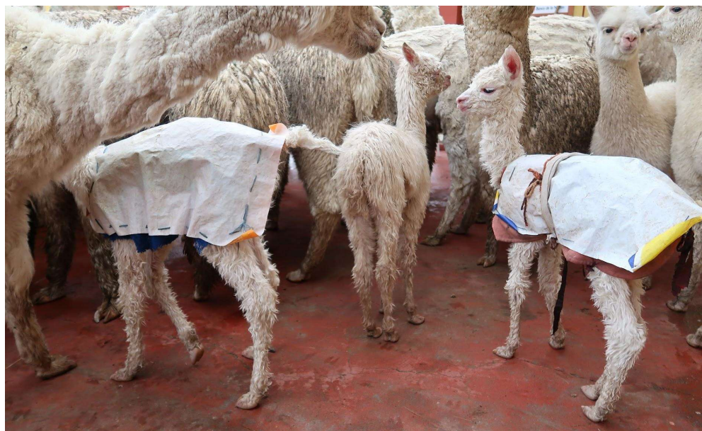
The farmer tries to protect crias from bad weather by covering them with a blanket under a plastic bag coat.