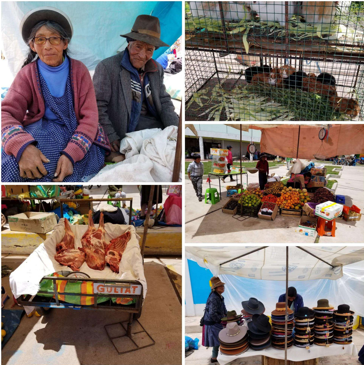
Different stands of products in the local market.

This was a Sunday and the weekly market day. No one works on market day. The team drove into town in a taxi to buy food, to get some lunch out and to look around. Everyone had a great day exploring local produce and food options. They were able to see a market that catered to the locals' needs and not to tourists.