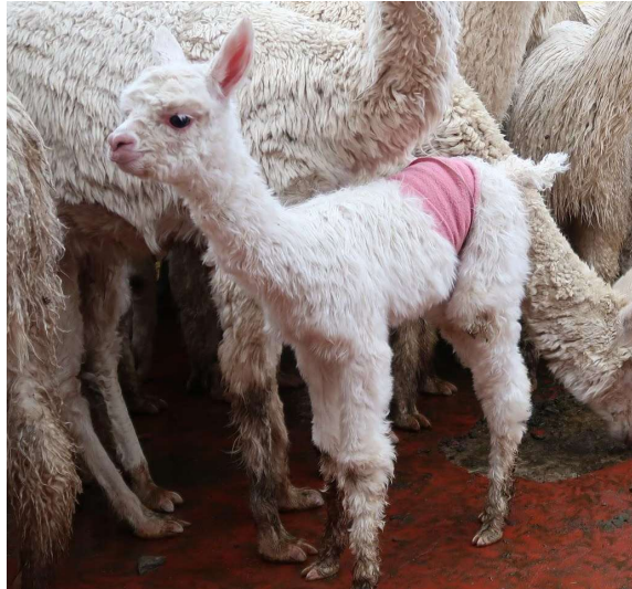
This farmer used a scarf to cover the cria's umbilicus to avoid contamination at birthing.