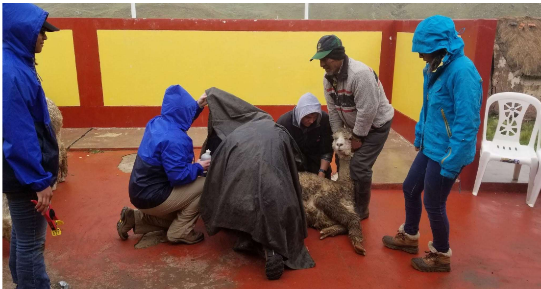
NP team examining an alpaca, looking for pregnancy with transabdominal ultrasound. Then poncho proves shade to be able to visualize the equipment screen.

The team evaluated and ear tagged 13 females and 2 males. The average age is 3.6 years old. He had a 70% pregnancy rate in the 13 females evaluated (low normal).