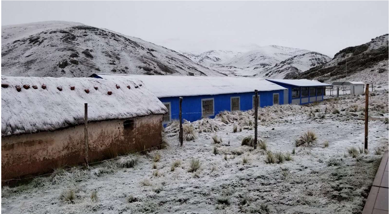
Snowy morning at the Tambo.