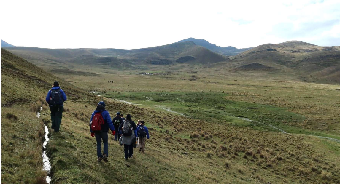
The team walking to see Farmer #2 .

The team evaluated 12 males. Not all males had eartags. They checked at color, type of alpaca, age, BCS, size and firmness of testicles, characteristics of fiber and for obvious diseases. The males were a mix of Huacayas and Suris. He had white, dark brown, and brown colored animals. They found one cryptorchid male, and some males with small and soft testicles. They felt like the stature of the 12 males was on the small side but the farmer did not agree in all cases. They chose 2 males that may be suitable loaners if needed, Both are older white Huacayas.