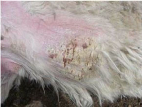
Figure 3: Sarcoptic Mange (Sarna) in Peru

(88.9%) evaluated were positive for trombiculosis. As infections had no correlation to pregnancy status or BCS score, these parasites seem to be more of a nuisance than a serious condition. A one time application of a topical petrolatum ointment is a very effective treatment against the mites.