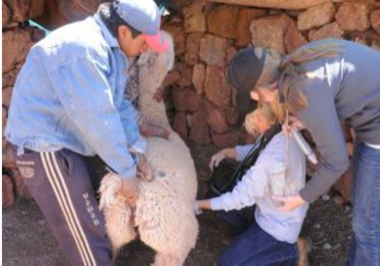
Figure 1: Determining pregnancy using the portable ultrasound. (Purdy, SR., Lessons Learned in the Peruvian Highlands )

reproductively are removed from the group. The teams also recorded the BCS for each of the selected females.